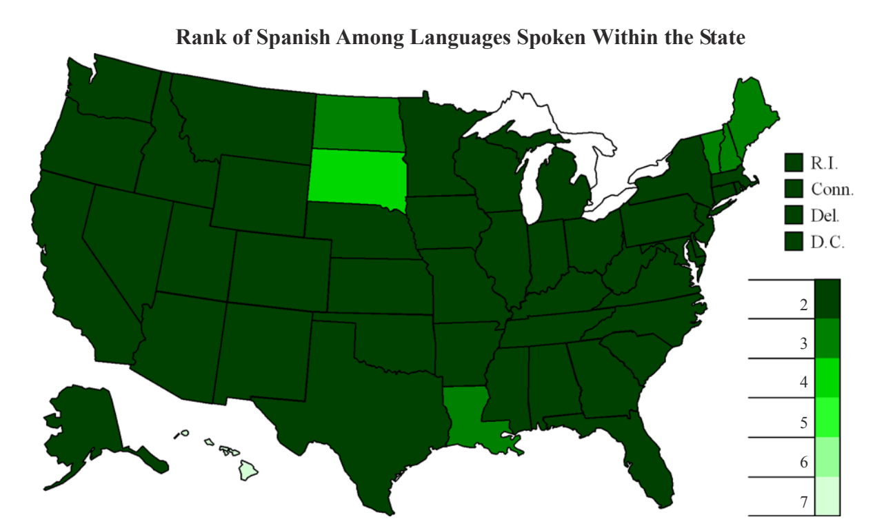
For information on how the data was derived, see Disclaimer

Percentage of State Residents Speaking Spanish at Home